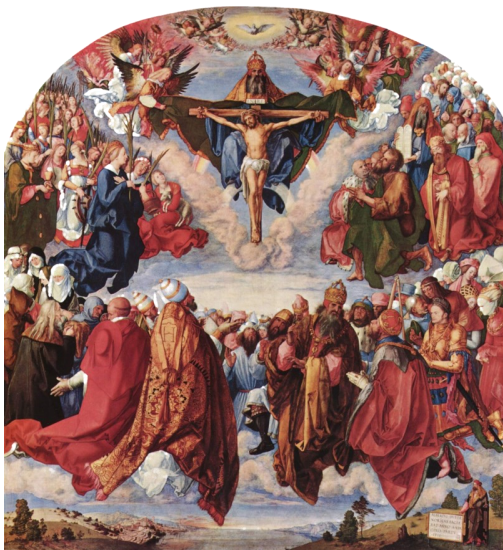
Adoration of the Trinity Albrecht Dürer (1471-1528)

From the treatise On the Mysteries by Saint Ambrose, bishop